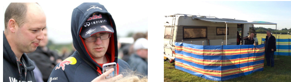
Figure 2 Participating members of the public

Power Events” which allows exclusive access to certain areas of the Silverstone circuit during the event. Group 2 is a family of two plus one friend who are frequent Formula 1 visitors. The two user groups do not know each other (Figure 2). We address the ethical challenges described in Section 2 using a combination of technical support and tailored user consent. The idea is to explore the balance between ethics and data openness. The pilot thus became a vehicle to investigate not only a technical proof of concept but also the ethical model for such community-driven experiments with user-generated audio-visual narrative content as the main experimental data.